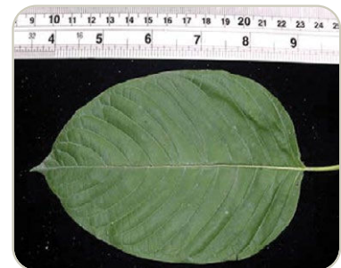
Leaf of kratom tree